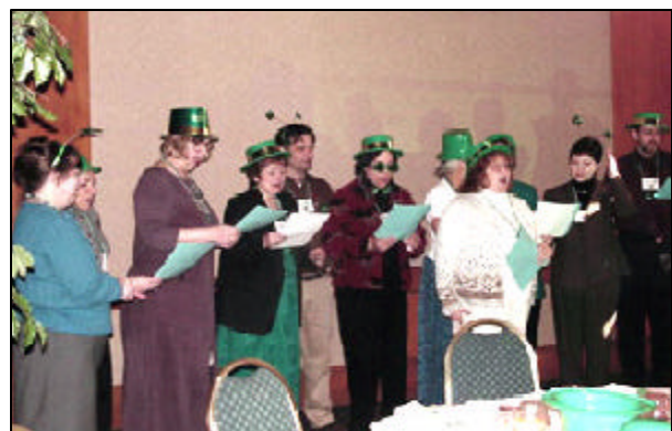
Savannah, Georgia, here we come!