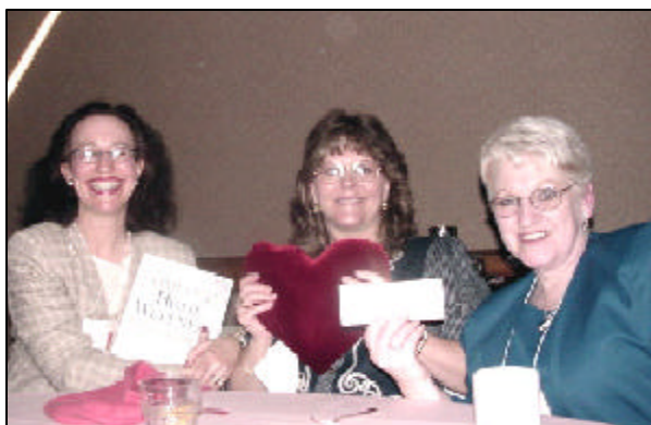
Love those door prizes!