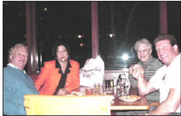
GHSLA members enjoyed great food and entertainment at the Crowne Plaza Ravinia in Atlanta.