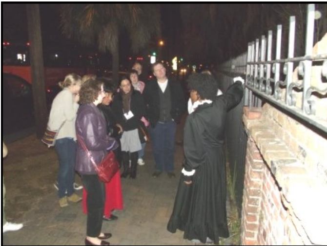
Ghosts & Graveyards Tour