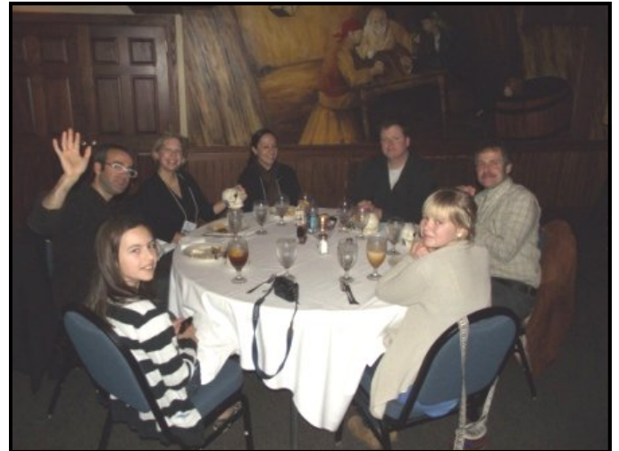
Dinner at the Pirate House