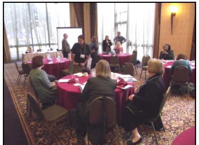
Members on break between lectures