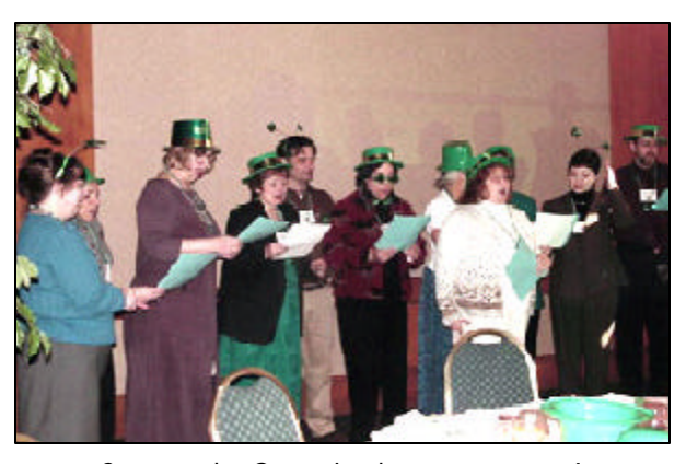
Savannah, Georgia, here we come!