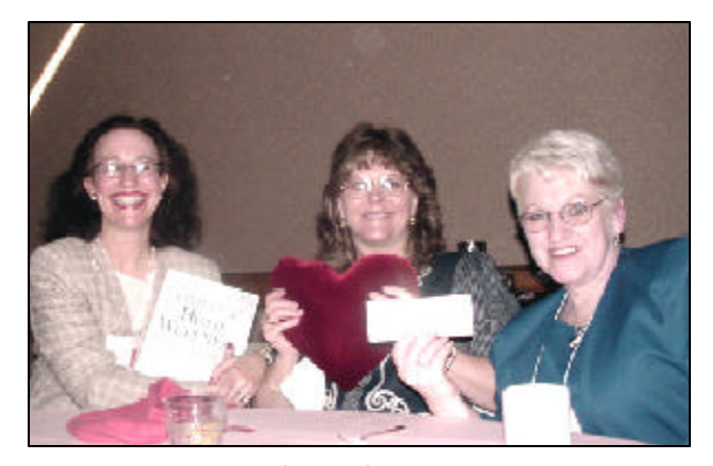
Love those door prizes!