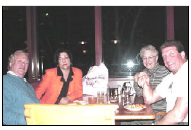
GHSLA members enjoyed great food and entertainment at the Crowne Plaza Ravinia in Atlanta.