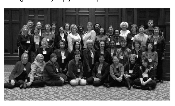
2006 Annual Meeting Attendees